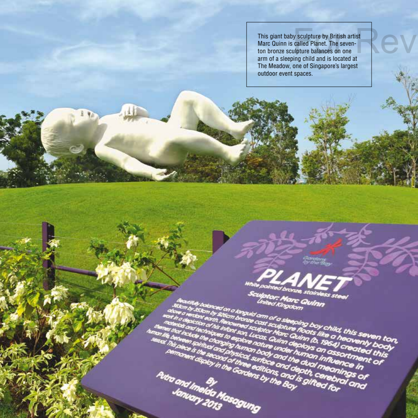
This giant baby sculpture by British artist Marc Quinn is called Planet. The seven-ton bronze sculpture balances on one arm of a sleeping child and is located at The Meadow, one of Singapore's largest outdoor event spaces.