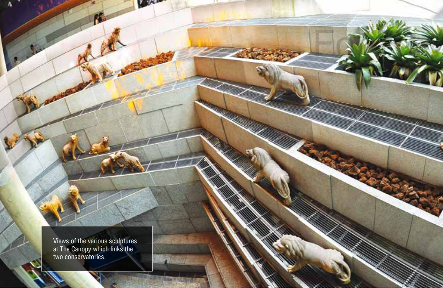
Views of the various sculptures at The Canopy which links the two conservatories.