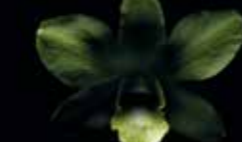
Dendrobium Aridang Green gx hybrid orchid, hybrid dendrobium Orchidaceae