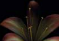
Clivia miniata cv. Natal lily, bush lily Amaryllidaceae