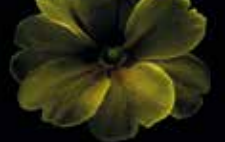
Primula vulgaris cv. primrose, common primrose, English primrose Primulaceae