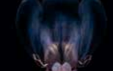
Justicia petiolaris blue justicia, justicia Acanthaceae