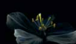
Geranium pratense 'Striatum' meadow cranesbill, meadow geranium, cranesbill, geranium Geraniaceae