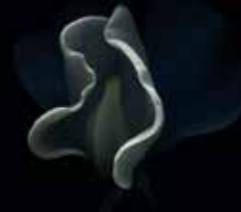
Lathyrus odoratus cv. sweet pea Fabaceae