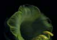
Cobaea scandens f. alba white cup-and-saucer vine, white cathedral bells Polemoniaceae