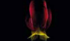
Abutilon megapotamicum abutilon, trailing abutilon, Chinese lantern Malvaceae