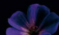
Geranium 'Gerwat' geranium [Rozanne™], cranesbill Geraniaceae