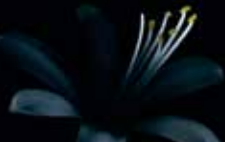
Agapanthus praecox subsp. orientalis 'PMN06' agapanthus [Queen Mum™], African lily, lily of the Nile Amaryllidaceae