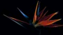
Strelitzia reginae bird of paradise, crane flower, strelitzia Strelitziaceae