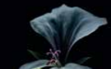
Pelargonium peltatum cv. ivy-leaved pelargonium, ivy-leaved geranium, cascading geranium, storksbill Geraniaceae