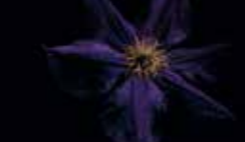
Clematis cv. clematis Ranunculaceae