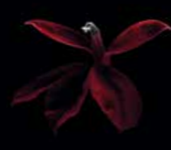
Lobelia cardinalis cv. cardinal flower, lobelia Campanulaceae