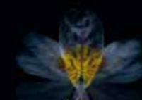
Schizanthus pinnatus butterfly flower, poor man's orchid, schizanthus Solanaeae