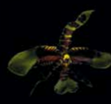
Rossioglossum Rawdon Jester gx 'Great Bee' hybrid orchid, hybrid rossioglossum Orchidaceae