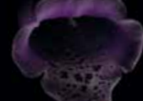
Digitalis purpurea cv. foxglove, common foxglove, digitalis Plantaginaceae