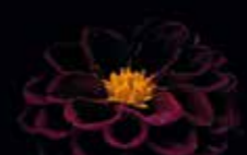
Dahlia cv. dahlia Asteraceae