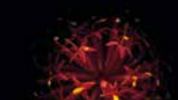
Kleinia galpinii Galpin's kleinia Asteraceae