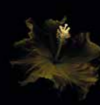
Hibiscus cv. hibiscus Malvaceae