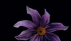
Dahlia imperialis tree dahlia, giant dahlia, imperial dahlia, dahlia Asteraceae