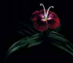
Dianthus barbatus cv. sweet William, dianthus Caryophyllaceae