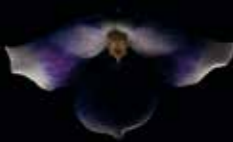
Viola hederacea Australian violet, violet, viola Violaceae