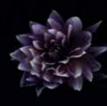
Dahlia 'Kidd's Climax' dahlia Asteraceae