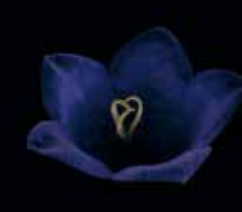
Campanula persicifolia cv. bellflower, peach-leaved bellflower, fairy bellflower Campanulaceae