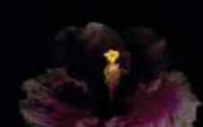
Hibiscus cv. hibiscus Malvaceae