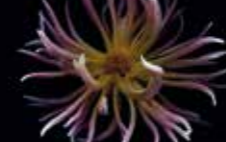
Dahlia 'Alfred Grille' dahlia, cactus dahlia Asteraceae