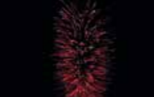
Melaleuca 'Kings Park Special' weeping bottlebrush, callistemon Myrtaceae