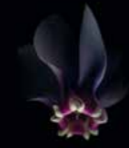
Cyclamen hederifolium cv. ivy-leaved cyclamen, cyclamen, sowbread Primulaceae