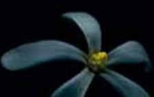
Ricinocarpus pinifolius wedding bush Euphorbiaceae