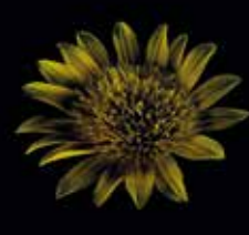
Gazania rigens cv. treasure flower, gazania, coastal gazania Asteraceae