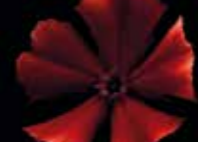
Silene sieboldii Siebold's catchfly, catchfly, campion Caryophyllaceae