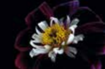
Dahlia 'Night Butterfly' dahlia, collerette dahlia Asteraceae