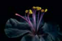
Geranium sanguineum cv. bloody cranesbill, bloody geranium, cranesbill, geranium Geraniaceae