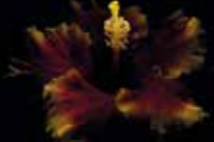
Hibiscus cv. hibiscus Malvaceae