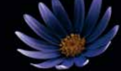
Felicia amelloides cv. blue daisy, blue marguerite, blue felicia, felicia Asteraceae