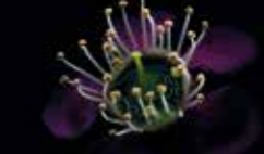
Leptospermum scoparium cv. manuka, manuka myrtle, New Zealand tea tree Myrtaceae