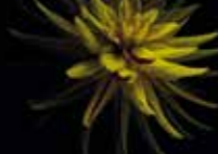
Dahlia 'Hy Pimento' dahlia, cactus dahlia Asteraceae