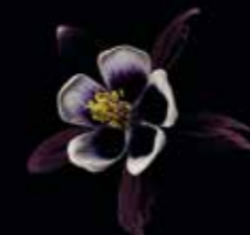
Aquilegia cv. columbine, granny's bonnet, aquilegia Ranunculaceae