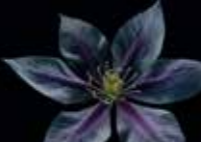
Clematis 'Andromeda' clematis Ranunculaceae