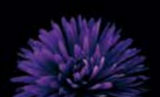
Symphyotrichum novi-belgii cv. New York aster, aster, Michaelmas daisy Asteraceae