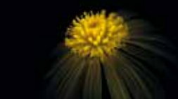
Euryops pectinatus golden daisybush, grey-leaved euryops Asteraceae