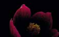
Abutilon 'Flamenco' abutilon, Chinese lantern Malvaceae