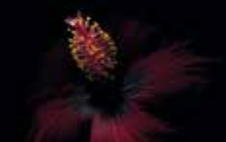
Hibiscus cv. hibiscus Malvaceae