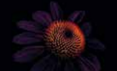
Echinacea purpurea cv. purple coneflower, echinacea Asteraceae