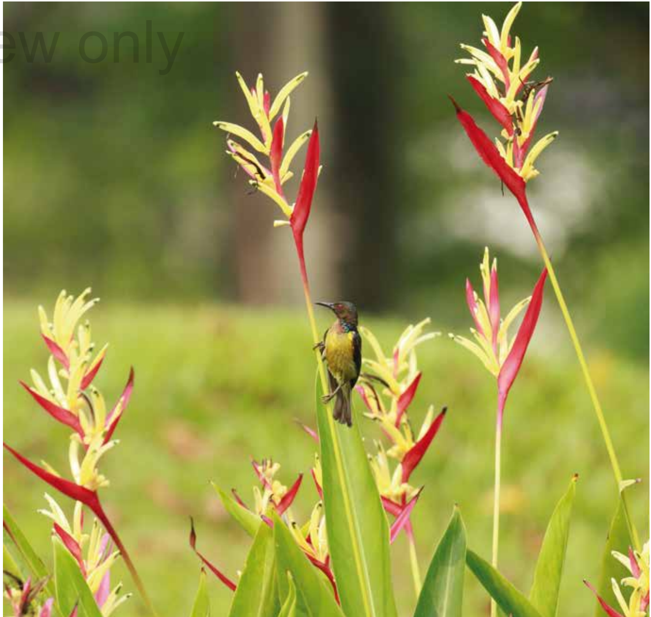
01 Ashy Tailorbird 02 Brown-throated Sunbird (female) 03 Scarlet-backed Flowerpecker (female) 04 Scarlet-backed Flowerpecker (male) 05 Brown-throated Sunbird