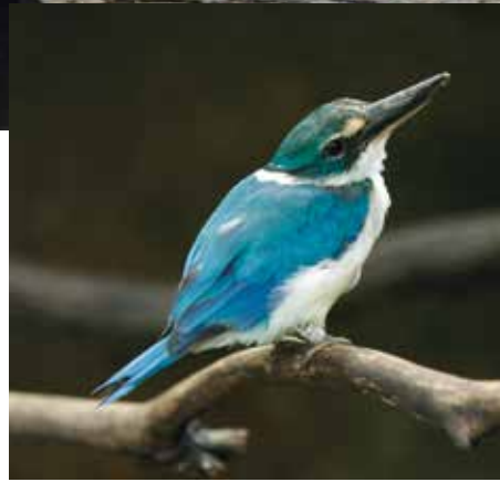
01 Common Green Magpie 02 Collared Kingfisher 03 Gouldian Finch 04 Oriental Dwarf Kingfisher 05 Blue-faced Parrotfinch 06 Superb Starling 07 Black-crested Bulbul 08 Java Sparrow